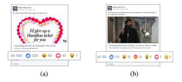
Figure 1: Two Washington Post Facebook posts with different emoticon reactions @ www.facebook.com/washingtonpost/

Copyright © 2018, Association for the Advancement of Artificial Intelligence (www.aaai.org). All rights reserved.